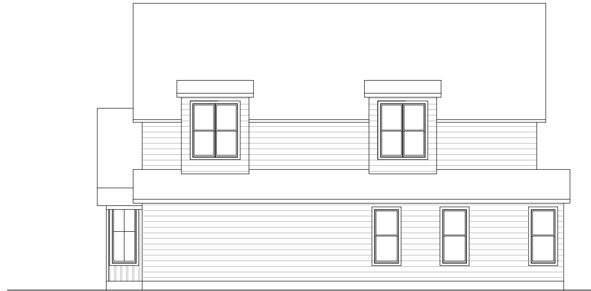
2 SIDE (SOUTH) ELEVATION Scale: NTS