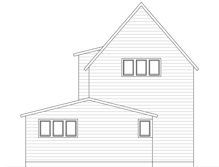
3 BACK (EAST) ELEVATION Scale: NTS