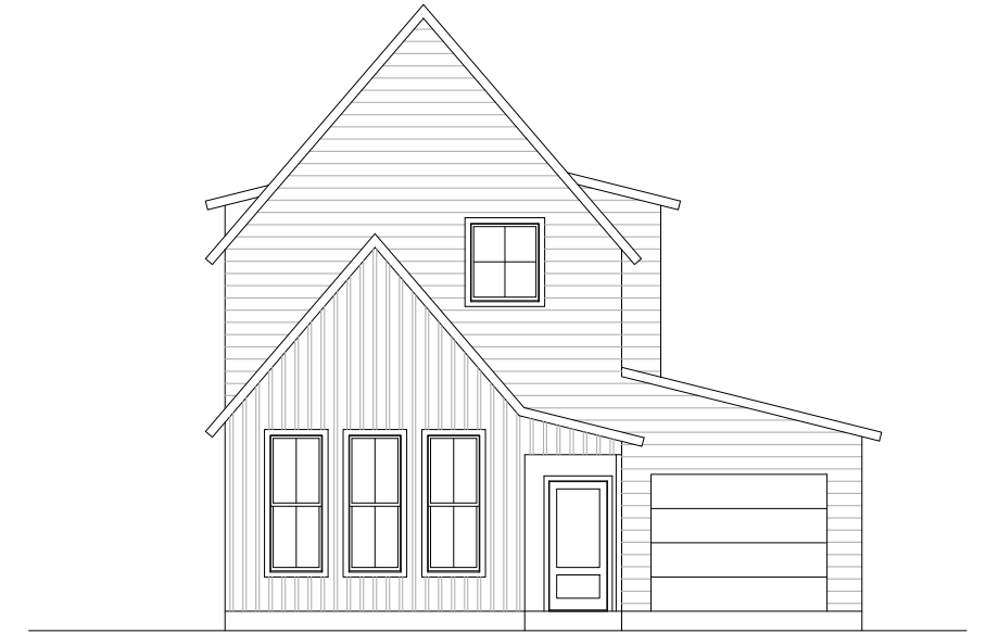
1 FRONT (WEST) ELEVATION Scale: NTS