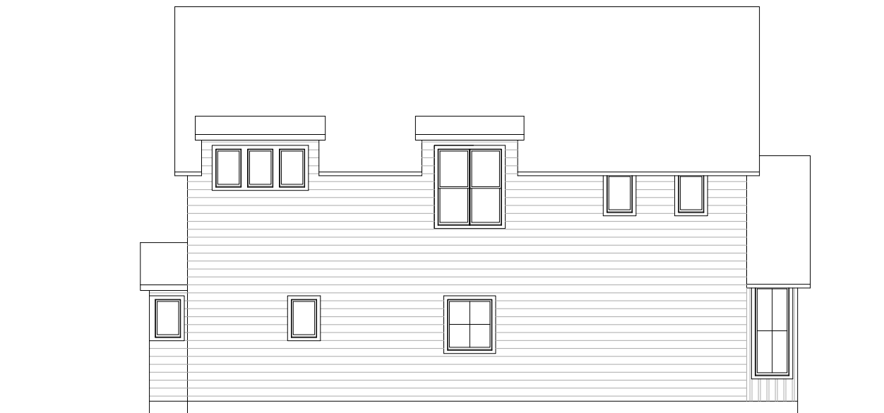
4 SIDE (SOUTH) ELEVATION Scale: NTS