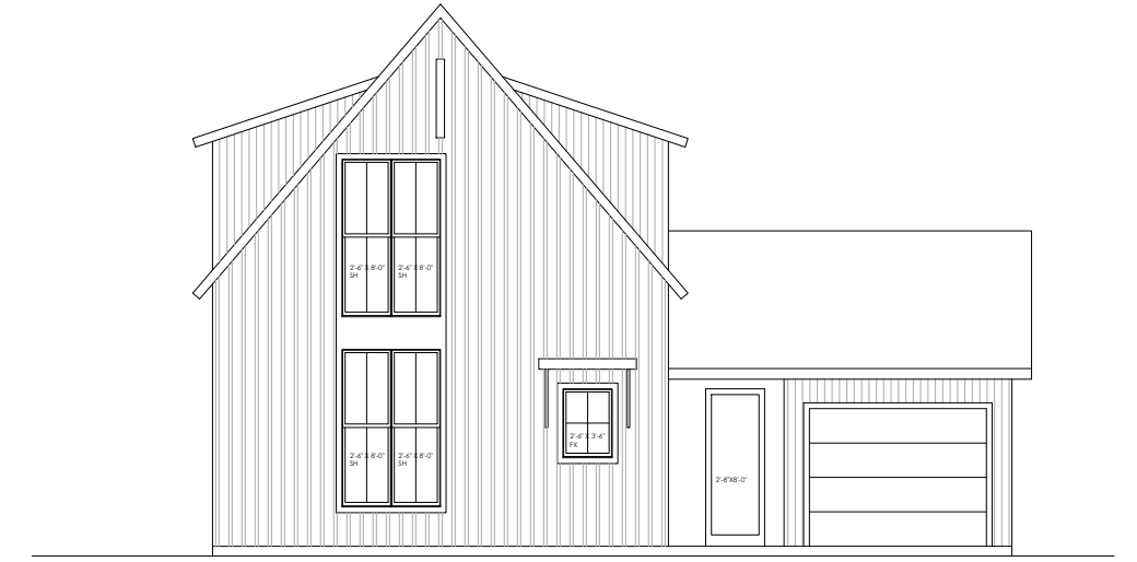
1 FRONT (EAST) ELEVATION Scale: 3/32"=1'-0"