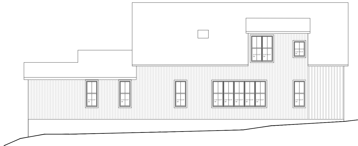
4 SIDE (SOUTH) ELEVATION Scale: 3/32"=1'-0"