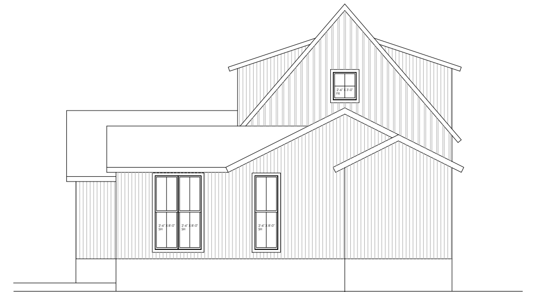
3 BACK (WEST) ELEVATION Scale: 3/32"=1'-0"